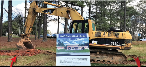
FROM GROUNDBREAKING TO RIBBON CUTTING