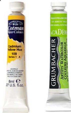
Recommended Paint Brands