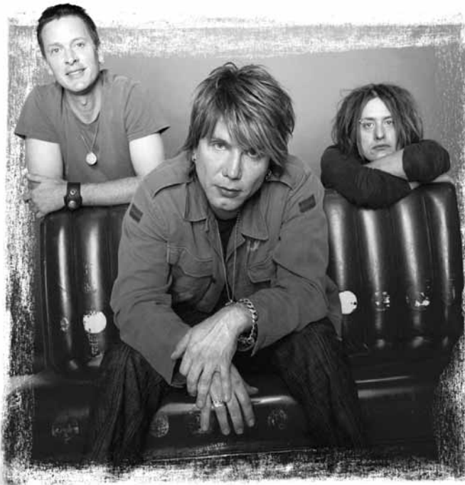
THE GOO GOO DOLLS

Corporate and community sponsorships offering designated seating and other amenities are available. For more information concerning sponsorships, contact the Office of Development and Alumni Relations at x9-6582. For more information on the Goo Goo Dolls and the concert, stay tuned to concert partners KISS 102.7 and UTV13; call x9-LIVE; or visit the concert web site at www.westga.edu/live .