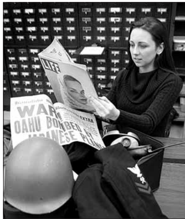
A Georgia Humanities Council grant will fund traveling trunks for teaching area middle school students about World War II and the Cold War.

The trunks' documents, photographs, clothing and other items are used with educational activities to help