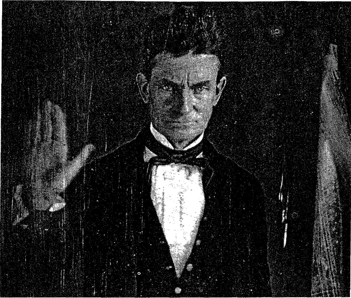
Brown with his hand raised as in oath in a daguerreotype made around 1846 by Augustus Washington, an African-American photographer.

Brown himself did not go. He was in his mid-fifties, old by the actuarial tables of his day; he seemed broken.