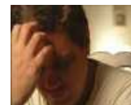
Aging Does Not Have Be Depressing

more videos are available in our health videos section .