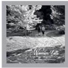
Purchase a new desk calendar

100% of all sales directly support the organization.