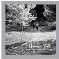
Purchase a new desk calendar