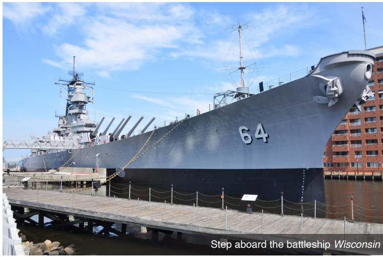
Step aboard the battleship Wisconsin

Numerous food trucks will be available for you to have lunch. Then, explore the history and significance of Fort Monroe, a National Historic Landmark, whose history spans 400 years. Later, visit the Virginia Air and Space Center whose permanent collection spans 100 years of flight, featured over 30 historic aircraft and the Apollo 12 Command Module. Meals: B, D