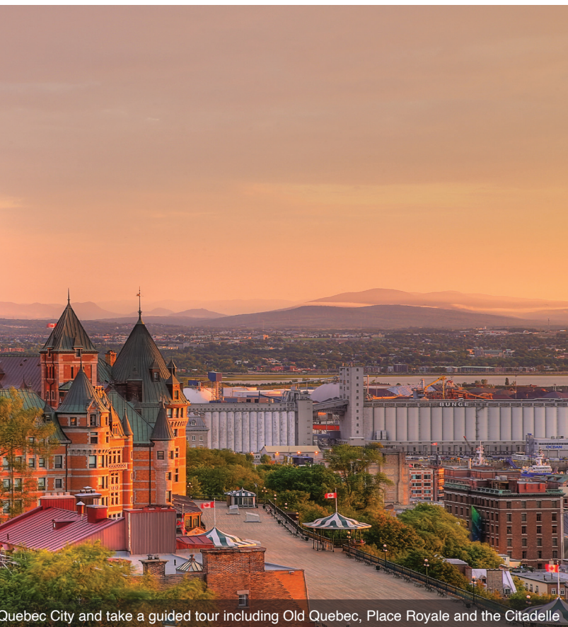
Quebec City and take a guided tour including Old Quebec, Place Royale and the Citadelle

DAY 6 Honey Bees, English Teas and Saint Michel: Begin at Miellerie Lune de Miel Honey Farm where this family-run business produces honey products. Learn its production and taste the sweetness. Then, stop for English High Tea in Quebec's fashionable Eastern Townships. In Sherbrooke, a local guide conducts a tour of the city's sites including the immense frescos highlighting the region's rich heritage and visit the Basilica-Cathedral of Saint Michel, a Gothic masterpiece. Meals: B, D