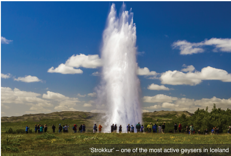
'Strokkur' – one of the most active geysers in Iceland

Enjoy free time for lunch on your own and shopping, then prepare to “take off” as you visit FlyOver Iceland. During this virtual flight, experience waterfalls, geysers, scenic landscapes, and the spectacular natural wonders of Iceland like never before. With the special effects of motion, wind, sound and scents, this unique “flying” experience is sure to be a highlight of your day! Return to the hotel late afternoon for an evening at leisure. Meal: B