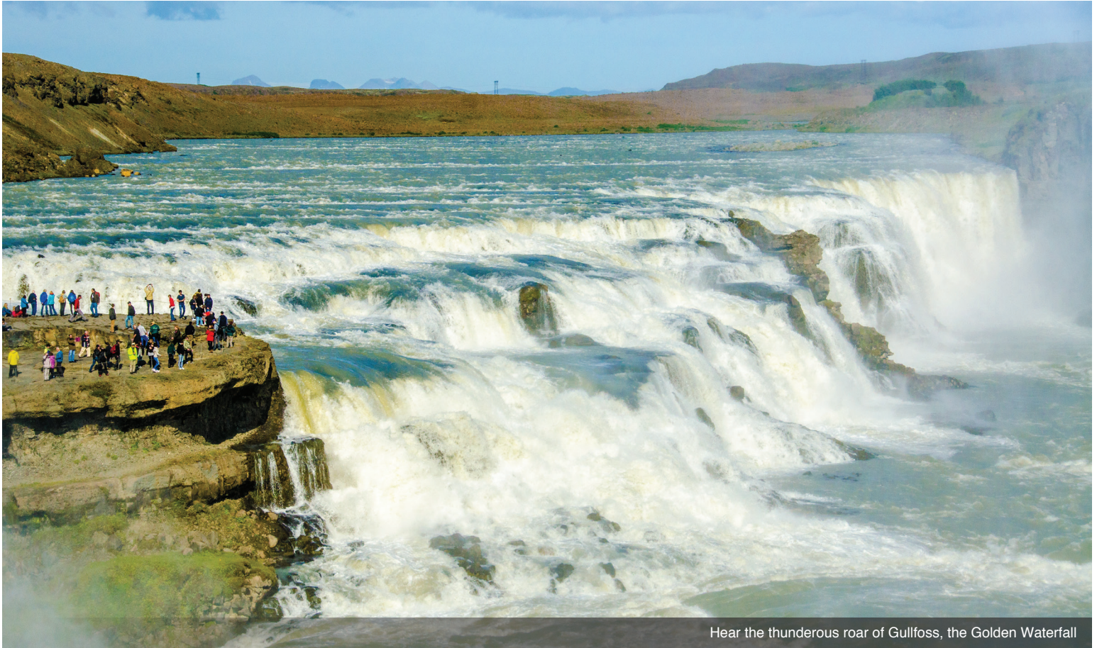
Hear the thunderous roar of Gullfoss, the Golden Waterfall