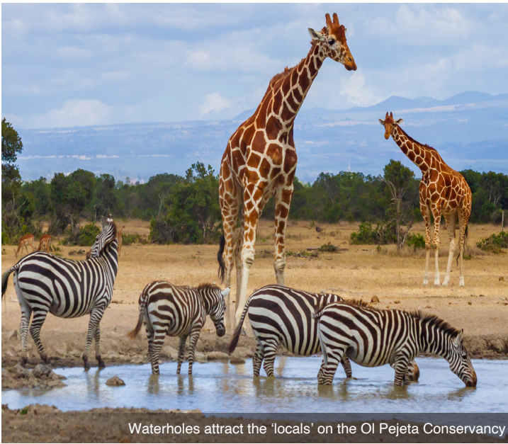
Waterholes attract the 'locals' on the OI Pejeta Conservancy