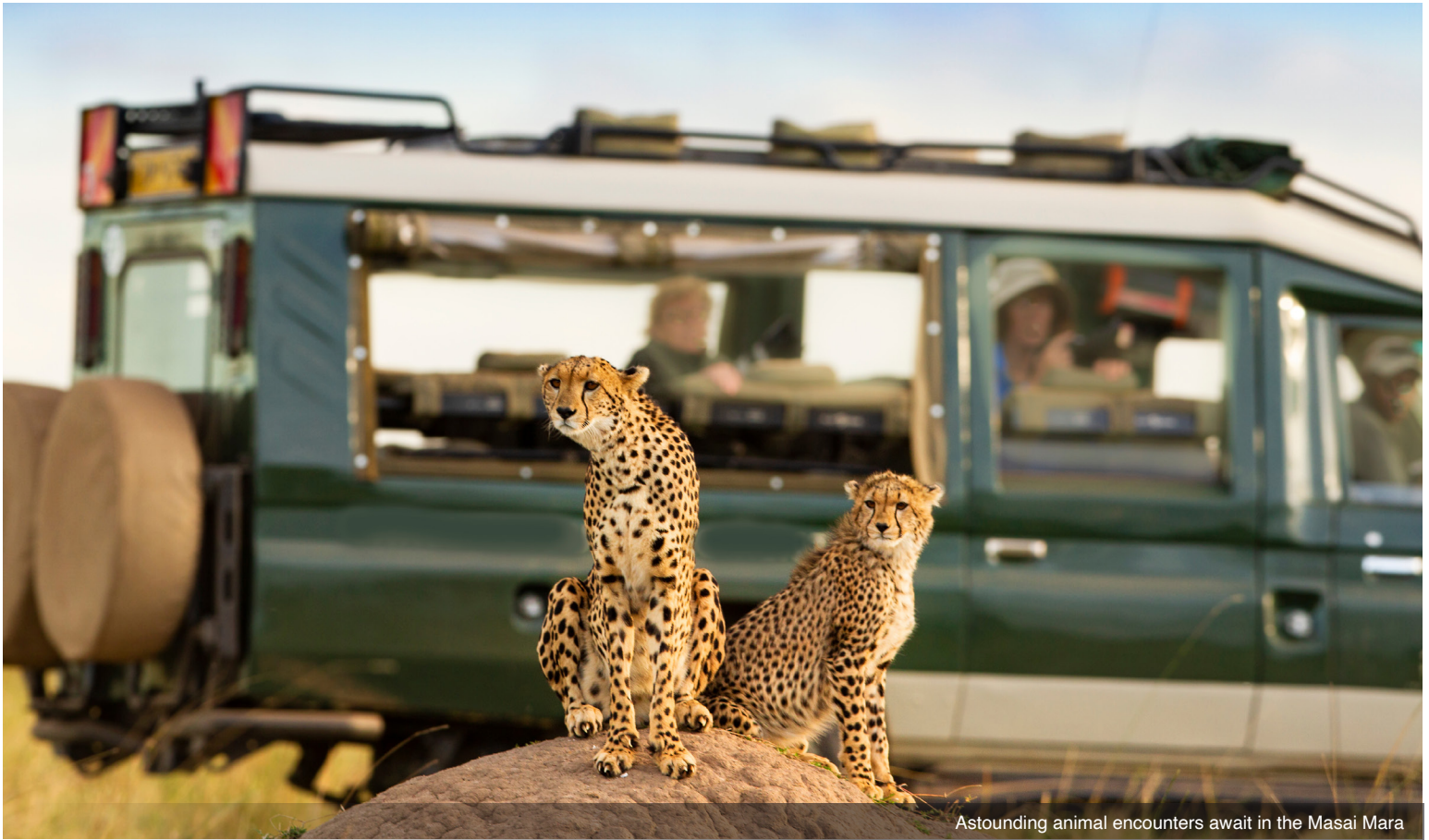
Astounding animal encounters await in the Masai Mara