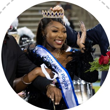
Homecoming Was Back – and Better Than Ever