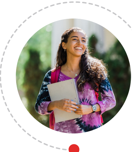
“Wolfie Finds His Howl,” Inaugural UWG Children’s Book, Released