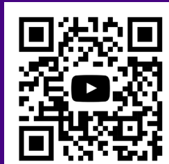
"Dark Matter" and "Demo"