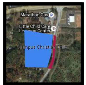
79 & 85 Tyus-Carrollton Rd.