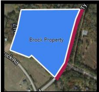
2715 Tyus-Carrollton Rd.