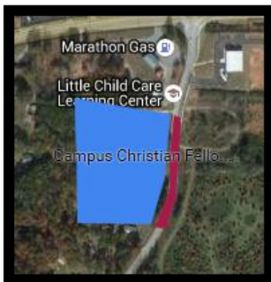
79 & 85 Tyus-Carrollton Rd.