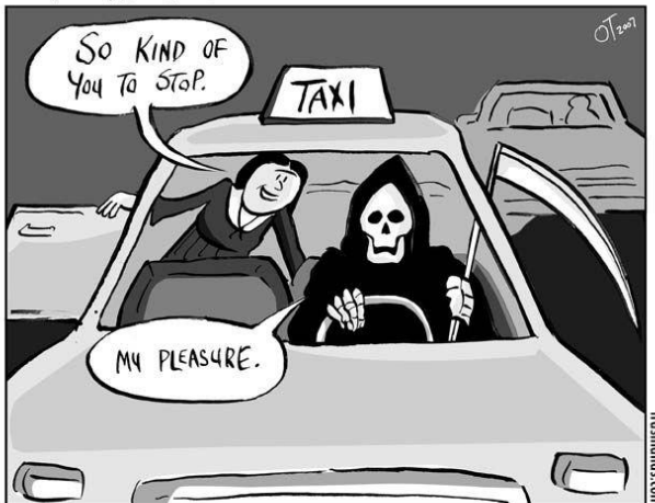
EMILY DICKINSON HAILS A TAXI

Thus, for this paper, I will ask you to do some historical research that helps you appreciate and explain what concepts, beliefs, conventions, or problems AMRO writers/texts challenged, and what kind of change they tried to create. This paper will require you to synthesize a primary text/author and historical material—both scholarship (e.g. published work on gender roles in 19 th century America) and two or three original sources (e.g. a painting or print that supports your literary-historical analysis). For example, in order to understand what made Fuller’s “The Great Lawsuit” radical for its time, you would research what concepts of women’s intellect, education, and social roles she