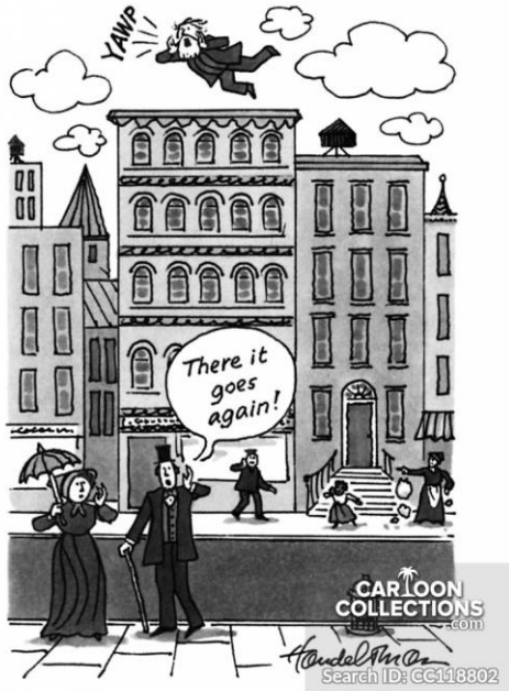
Walt Whitman sounds his barbaric yawp over the roofs of the world.

COURSE DESCRIPTION: Emerson, Thoreau, Hawthorne, Melville, Whitman, Dickinson—if a list of these 19th-century American authors makes you yawn, this course will help you wake up to the fresh and radical ideas of a generation of writers who tried to rouse their contemporaries from the dusty remains of Puritanism, the complacent acceptance of slavery, the mindless imitation of European literature and culture, the smug belief in the exceptionalism of American liberty, the debasing of human sexuality as filth, the degradation of the natural environment and—above all—the inability to think independently. Women writers such as Margaret Fuller and Fanny Fern as well as escaped slaves such as Frederick Douglass and Harriet Jacobs fueled the spirit of discontent and radical change from the “margins.” In this course, we will study how the new art forms, philosophies, and social movements emerging from this period affected 19th century America, but we will also explore how they have