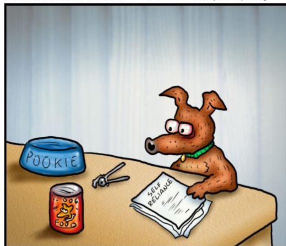
Ralph Waldo Emerson's dog

This cartoon is made available on the Internet for personal viewing only. Opinions expressed herein are solely those of the author.